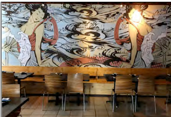
↓ Interior of Zoku Sushi