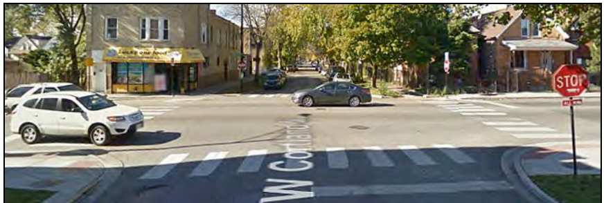
↑ Cortland and Pulaski intersection

New traffic lights were installed at the intersection of Pulaski and Cortland and replaced the former stop signs. The lights help to protect the McAuliffe students as they walk to school.